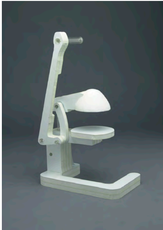
First basic prototype study model or mockup